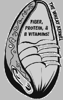
The Whole Grain

Compliment dinner with WHOLE GRAIN dinner rolls.